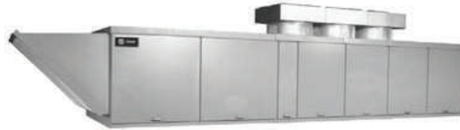
Table 9. Triple furnace - arrangement B-L