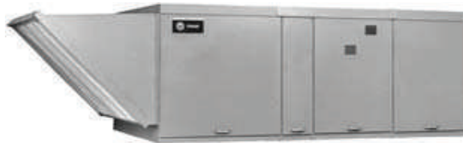
Table 7. Single furnace - arrangement B–L