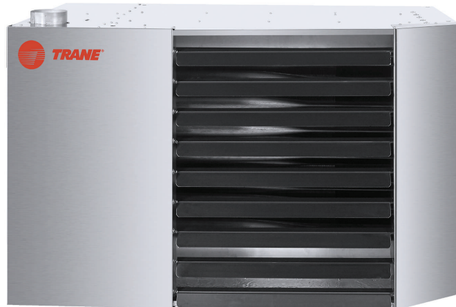
Figure 10. Gas fired high efficiency unit heater (model HI)

Model HI is available in 6 sizes - 50, 100, 150, 200, 300 and 400 MBh, in both natural gas and LP gas, and can be vented through PVC and CPVC for application flexibility. All units are field convertible to separated combustion.