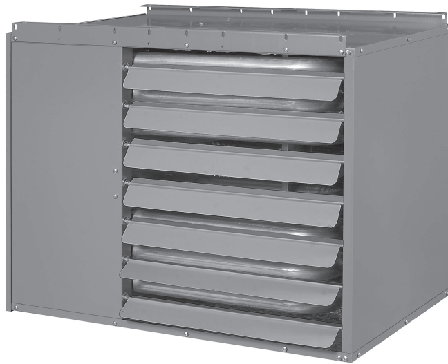
Table 1. Performance data - tubular propeller unit heater