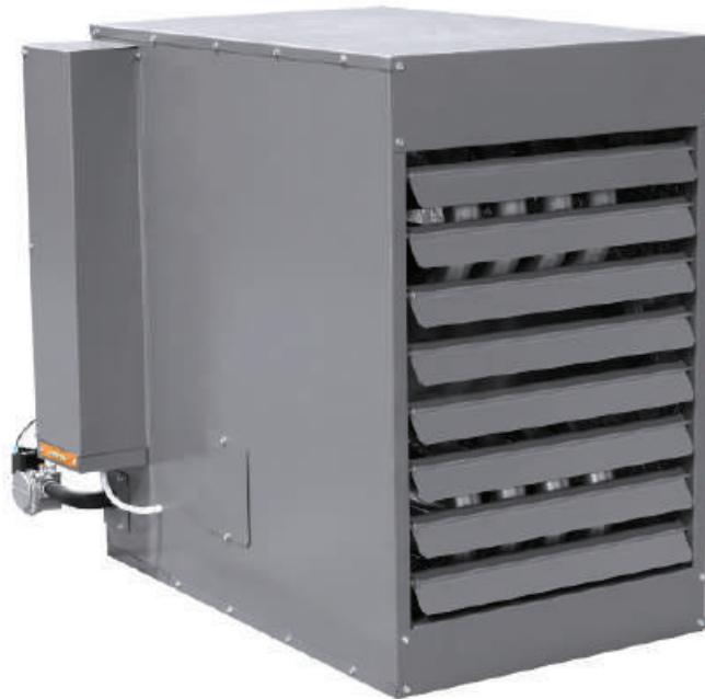
Table 2. Performance data - propeller fan gas unit heater