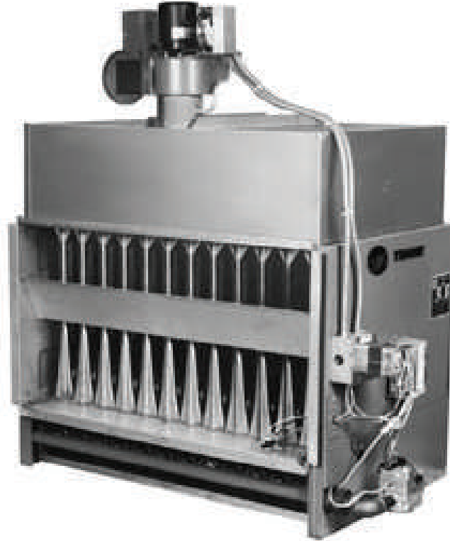
Table 4. Performance data - power ventilated indoor gas duct furnace