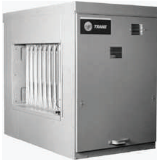
Table 6. Performance data - single rooftop gas duct furnace - arrangement A, standard temperature rise