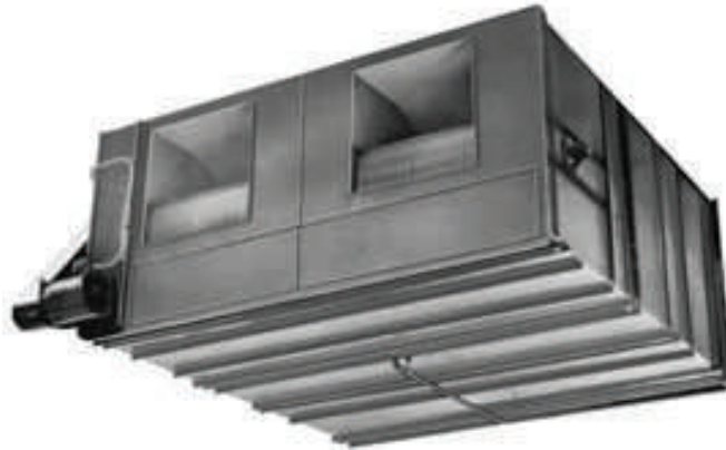
Table 12. Direct fired indoor gas make-up air heater